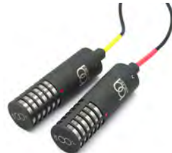
FSM88 2 x C8 / 2 x CMP1C connected to XLR5, MSXY, CLIP20, Foam screen 3, Break out cable