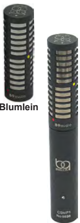
88: 2 x Figure-8 mounted at 90° Blumlein pre-stage

15 capsules available : C2F, C2H, C2HH, C2HHH C30F, C30H, C31F C4F, C4LC, CV4F C5F, C5LC, CV5F C7 C8