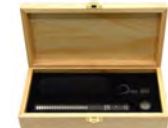
BOX2 only for CM170F & Blumlein