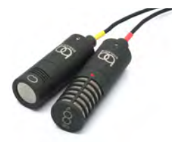
FSM48 1 x C4F - 1 x C8 / 2 x CMP1C connected to XLR5, MSXY, CLIP20, Foam screen 3, Break out cable