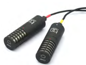
FSM44V 2 x CV4F / 2 x CMP1C connected to XLR5, MSXY, CLIP20, Foam screen 3, Break out cable