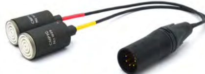
CMP1C duet (with cable - 30cm - and XLR5 connector)