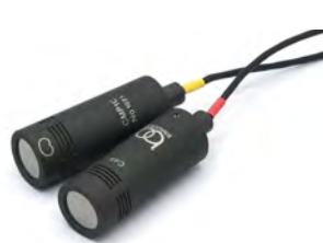
FSM44 2 x C4F / 2 x CMP1C connected to XLR5, MSXY, CLIP20, Foam screen 3, Break out cable