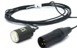
CMP1C solo (with cable - 3 m - and XLR3 connector)