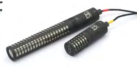
FSM78 1 x C7 - 1 x C8 / 2 x CMP1C connected to XLR5, MSXY, CLIP20, Foam screen 4, Break out cable