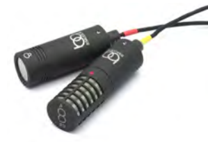
FSM58 1 x C5F - 1 x C8 / 2 x CMP1C connected to XLR5, MSXY, CLIP20, Foam screen 3, Break out cable